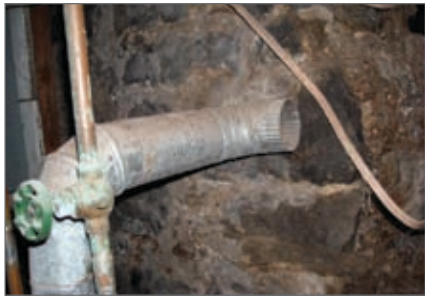
Flue pipe doesn't reach the chimney, so flue gasses can't leave the building.

Some problems are obvious. Some are not. With proper training and equipment, a technician can identify dangerous conditions that otherwise might go undetected. These valuable skills can save lives.