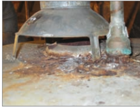
Signs of spillage.