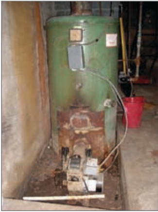
Signs of flame rollout.