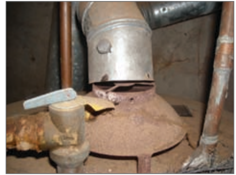
Disconnected flue pipe.

pressure and compares it to a chart of acceptable minimum draft pressure ranges.