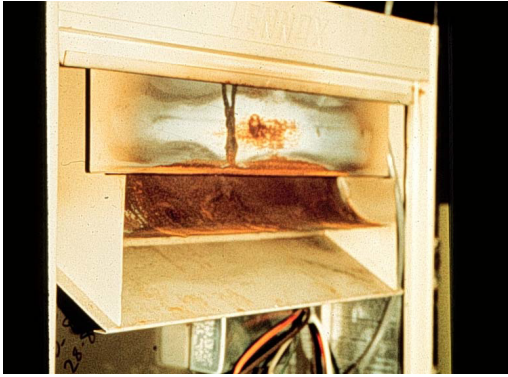
Rust on draft Diverter