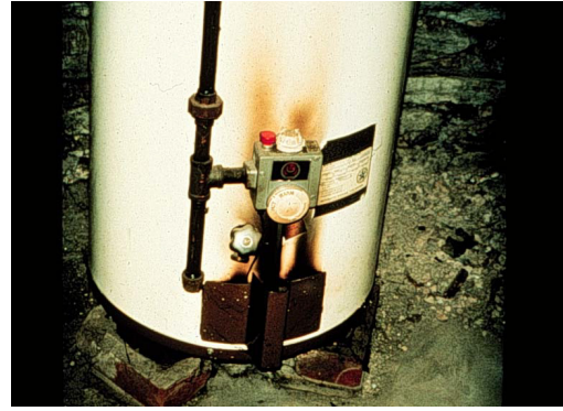
Burn marks at combustion chamber